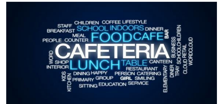
Cafeteria/Canteen/Snacks vending Machine