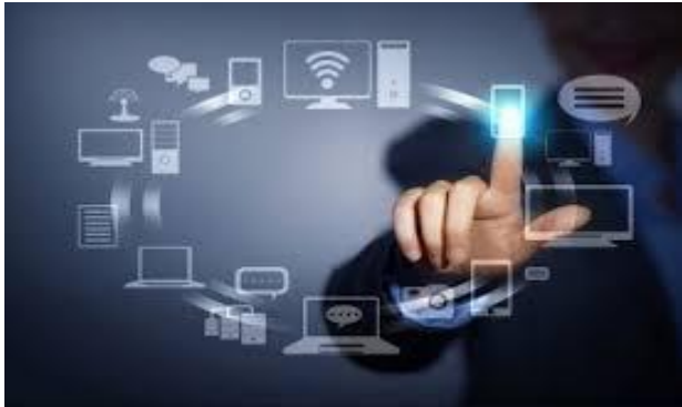
State of the art offshore center in Chandigarh