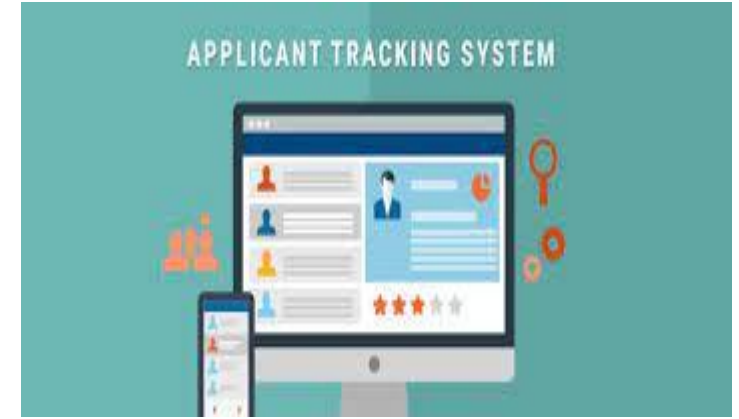
Applicant Tracking System to manage employees, clients