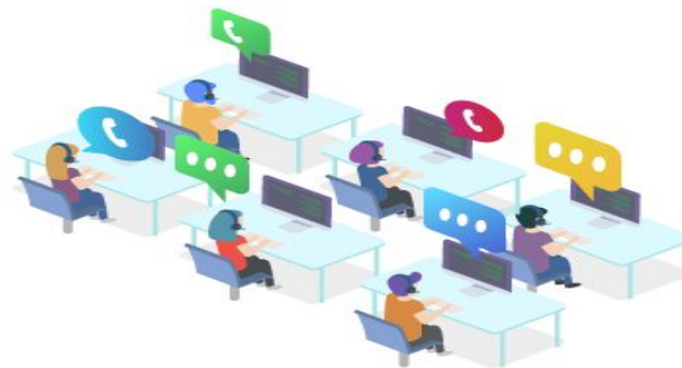
Dedicated HR, Finance, Operations and Training Department