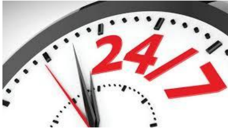
We offer 24 x 7 operations catering PST, EST and IST time zones